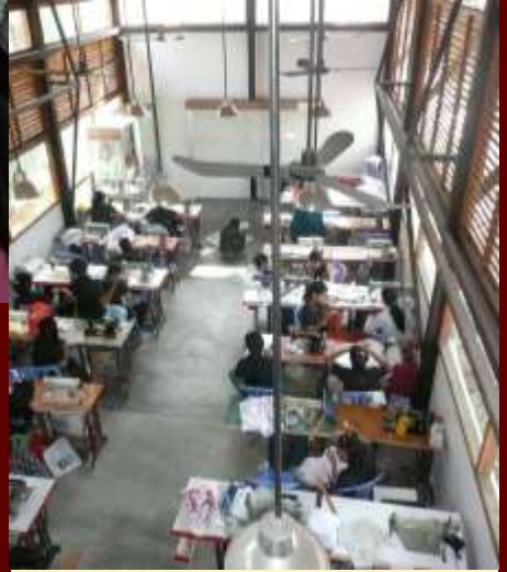
Learning a language and building a future