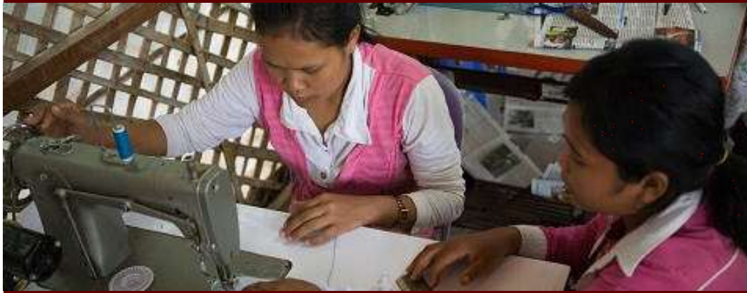
Training continues in a brand new building!